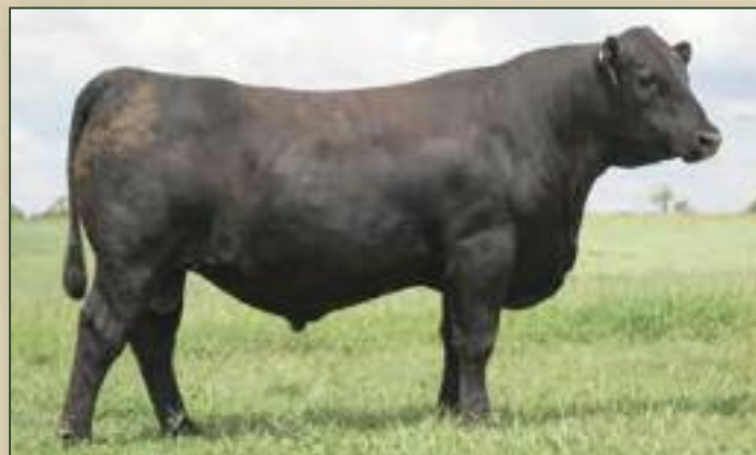
Yon Fortress E1111 – Sire of Lots 38-39, 42-44

Ranks in top 15% for CED and WW. 20% for BW, YW, Marbling and Ribeye.