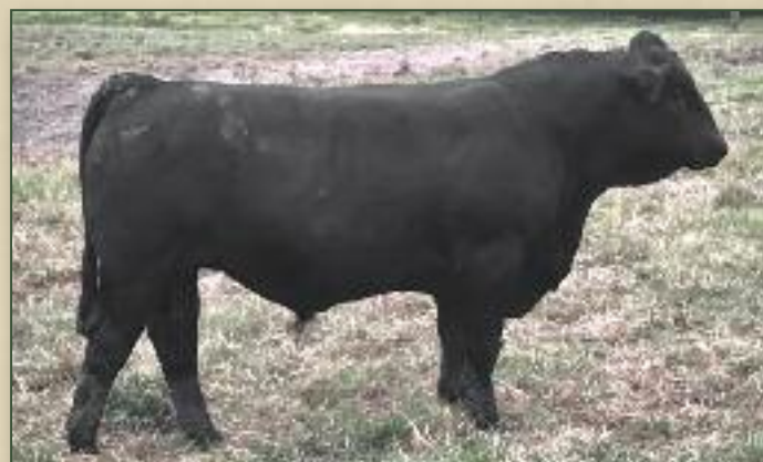
Lot 27 - 23H

Embryo Transplant, Purebred Simmental Bull that ranks in the top 25% for BW, WW, YW, ADG, MCE, Milk, MWW, CW, Marb, REA and in the top 10% for both All Purpose Index and Terminal Index. His donor dam has been one of our most productive cows.