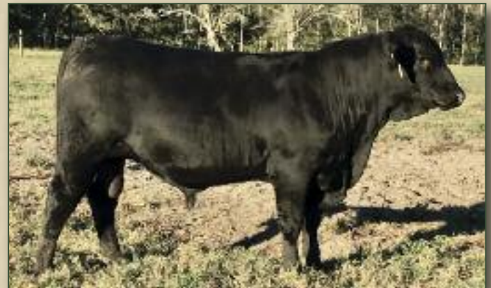
Lot 6 - 26H

Ranks in the top 25% of the breed for BW, MCE, Milk, STAY, CW, Marb and top 10% for All Purpose Index and top 15% for Terminal Index. Dam has a 368 day calving interval on five calves and an average of 49% of her body weight weaned.