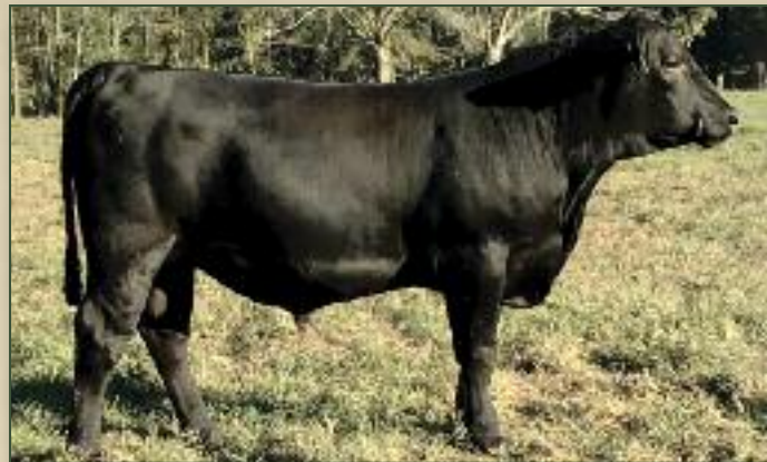
Lot 39 – H141

DDC. AI sired by GAR Xceptional. Ranks in Top 3% for $G, 10% Marbling, $B and $ Combined. 15% Docility. 30% for YW, RE, $M and $W.