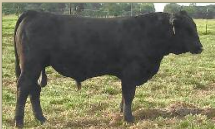
Lot 29 – 10H