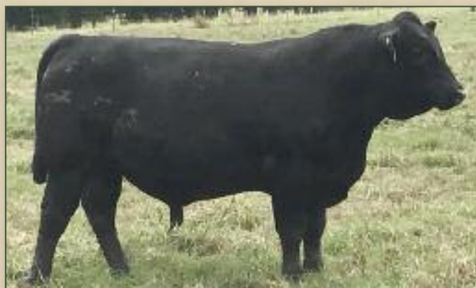
Lot 45 – H29