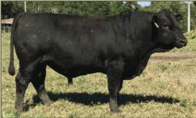
Lot 10 – H785

This coming 2 year old is AI sired by Hooks Baltic. A lot of bull here ranking in top 15% for Docility and 25 % for Calving Ease.