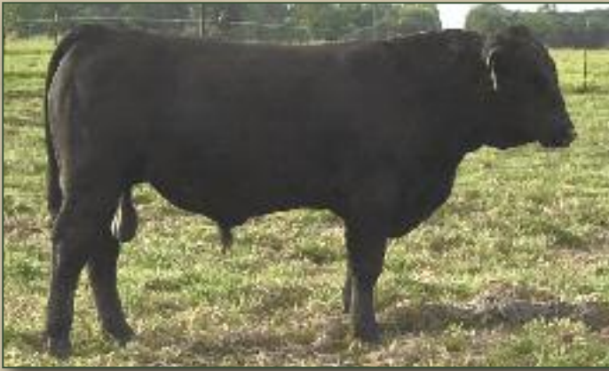
Lot 14 - 13H