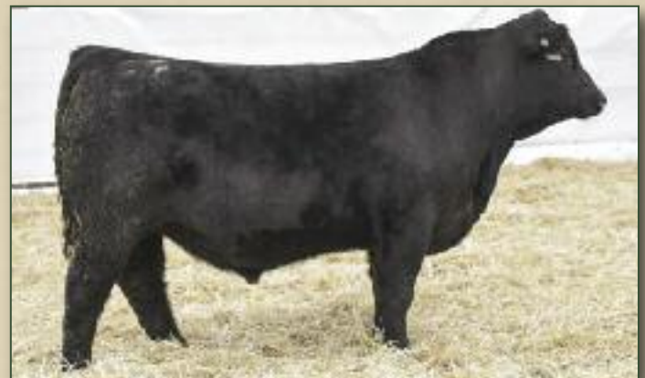
GW Triple Crown - Sire of Lots 1, 6, 16

All sired by KBHR High Road. This calving ease bull ranks in top 15% for CW, Marbling, API and TI. 20% for Calving Ease.