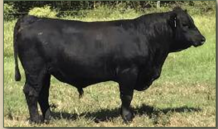
Lot 21 – H36