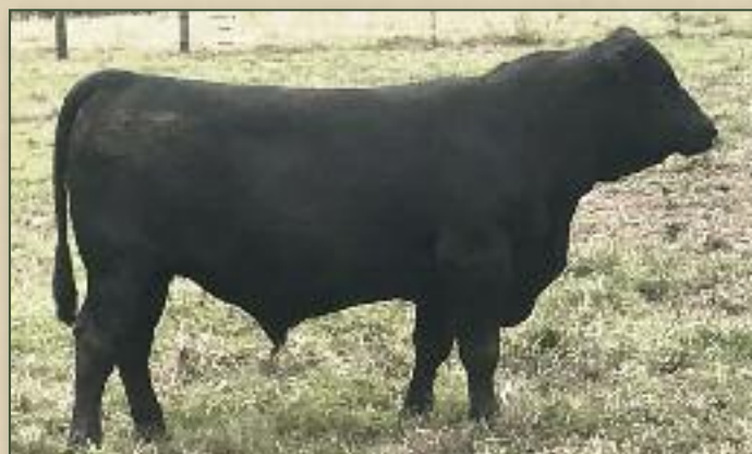
Lot 35 - H164

Very unique package here! AI sired by Basin Payweight 1682. He combines calving ease, carcass and growth with eye appeal! He ranks in top 10% for YW, Marbling and $W. 15% for WW, $B and $CCombined. 20% for CED and CW.