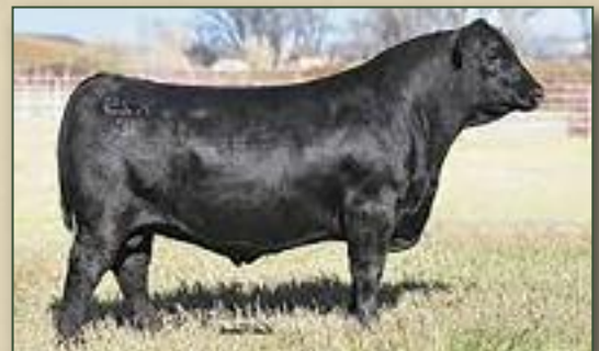
G A R Ashland