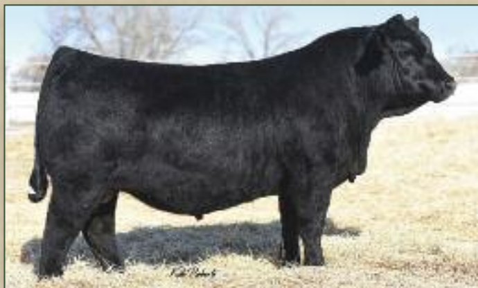
Hook's Eagle 6E – AI sire of lots 29-31