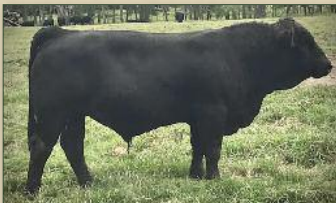
Lot 30 – 18H