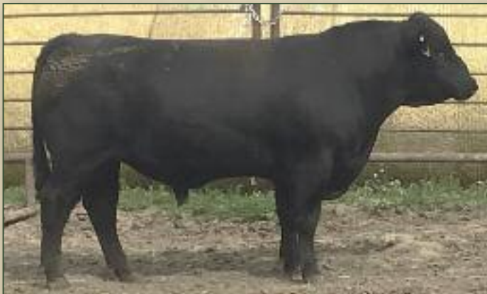
Lot 11 – H40

Coming 2 year old ranking in top 4% for WW, YW, CW and Terminal Index.