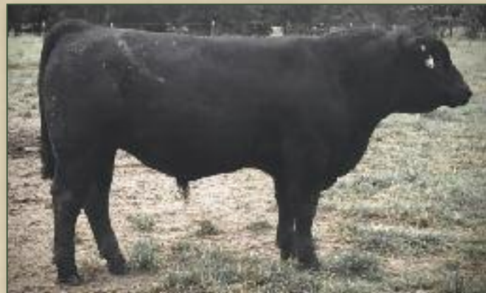
Lot 25 - 3H

Purebred Simmental Bull that ranks in the top 25% for Wean, Year, ADG, Milk, MWW, DOC, CW, Marb, REA, Shear and in the top 3% for All Purpose Index and top 1% for Terminal Index. Dam has a 374 day calving interval on her first three calves and an average of 54% of her body weight weaned.