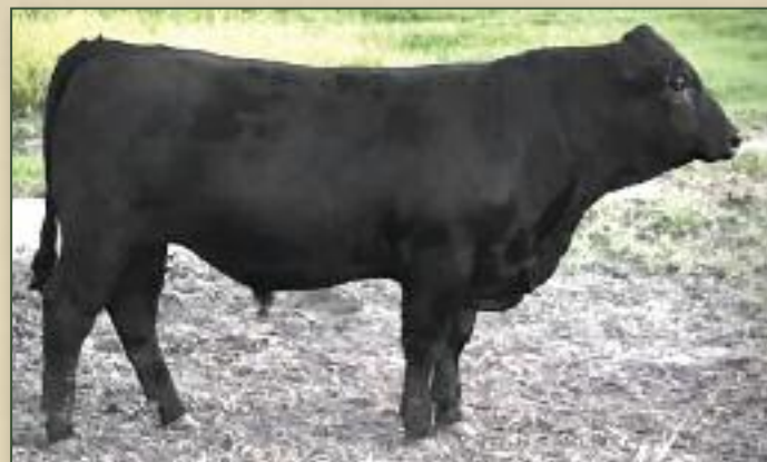
Lot 28 - CH30

DDP. Ranks in top 15% for Calving Ease, YW and CW. 25% for WW and TI.