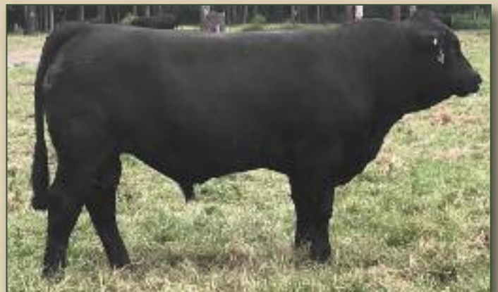
Lot 8 - CH18

All sired by Cowboy Cut. Very docile, ranks in the top 25% for All Purpose Index.