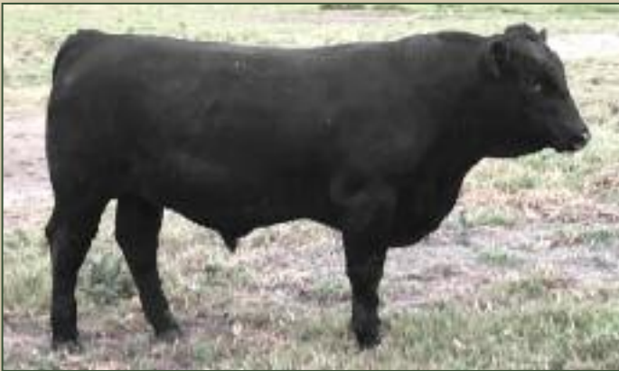
Lot 3 - H38

Ranks in the top 25% of the breed for CE, Wean, Year, ADG, MCE, Milk, MWW, DOC, CW, Marb, REA and a top 10% ranking for All Purpose Index and top 5% for Terminal Index. Heifer bull with breed leading growth! Dam has a 364 day calving interval on seven calves and an average of 55% of her body weight weaned.