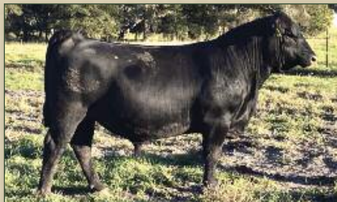
Lot 34 - H44

AI sired by GAR Ashland, Top 1 % for Ribeye, Top 5 % for WW, YW and $W.