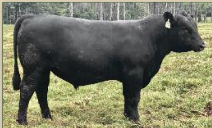
Lot 40 – 2042

Carcass and Growth package here! Ranks top 3-5% for Ribeye, $Combined, $B and $W. 10% for WW, YW and CW. 20% for Marbling.