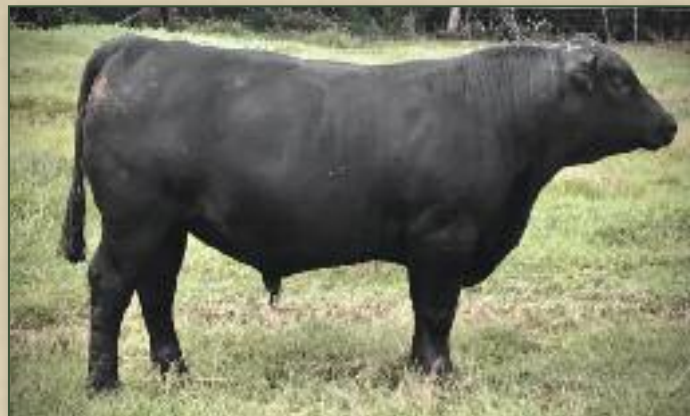
Lot 33 - H845

AI sired calving ease bull by GAR Ashland. Ranks in top 1% of the breed for $B and $CCombined. 4 % for Marbling. 20% for CED, Docility, CW & $M.