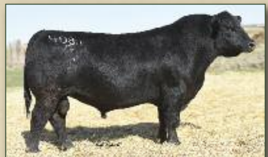
G A R Xceptional