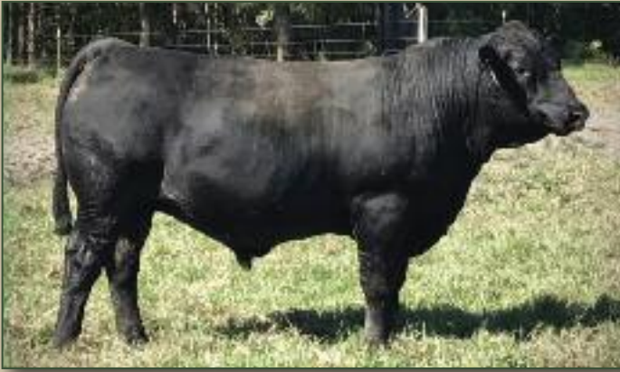
Lot 1 - 2H