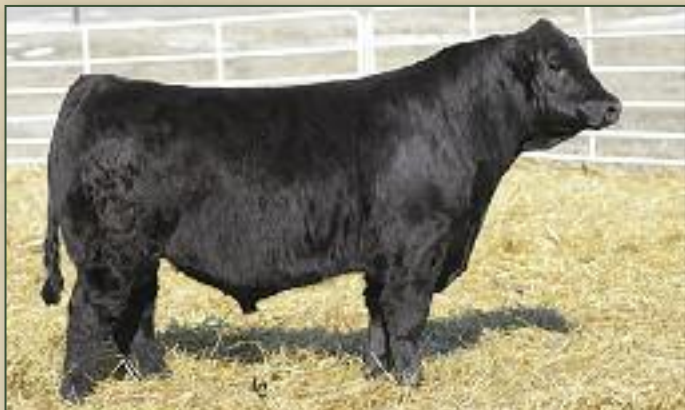
KBHR High Road

Ranks in the top 25% of the breed for CE, Wean, Year, ADG, Milk, MWW, CW, Marb, Shear and top 10% for All Purpose Index and top 1% for Terminal Index.