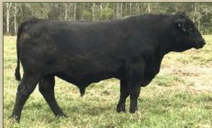
Lot 42 – H79

Here's a coming 2 year old that ranks in top 2% YW, 4% WW and top 10% for $W.