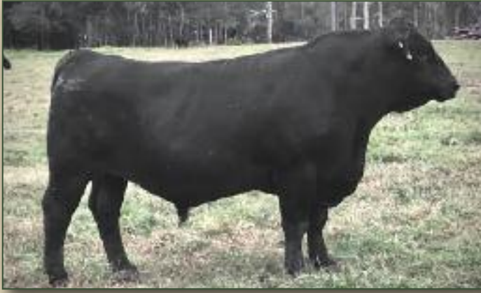
Lot 9 – H150