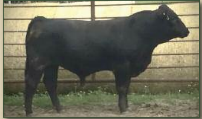
Lot 15 - H55