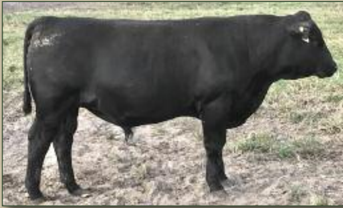
Lot 19 – H723