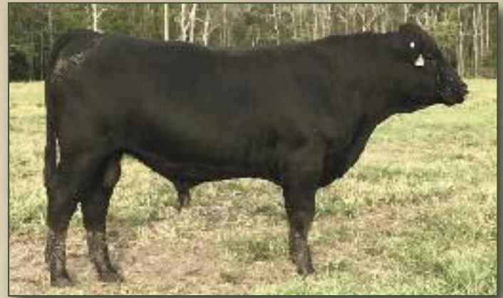
Lot 5 - CH12

All sired by Cowboy Cut. Ranks in top 10% for Docility. 15% for Marbling and Terminal Index. 20% for Calving Ease and All Purpose Index.