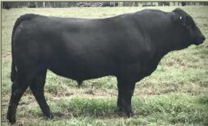
Lot 12 – H93

Coming two year old bull that ranks in the top 25% of the breed for BW, Stay, YG, Marb and REA.