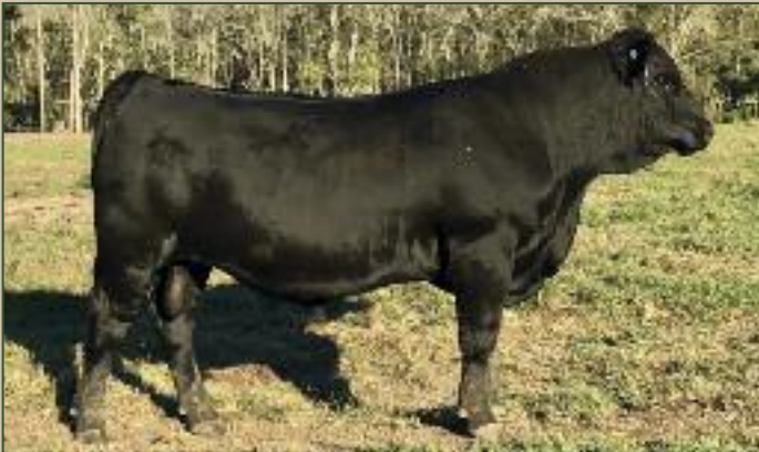
Lot 2 - 8H

Ranks in the top 25% of the breed for CE, BW, ADG, MCE, STAY, DOC, CW, Marb, REA, Shear Force and a top 2% ranking for All Purpose Index and top 3% for TI. Dam has a 357 day calving interval on three calves. Definite heifer bull with great carcass data!