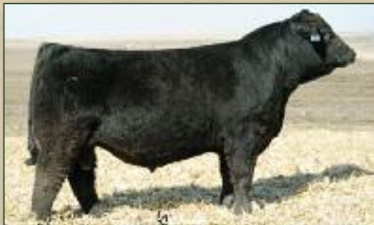
CCR Cowboy Cut