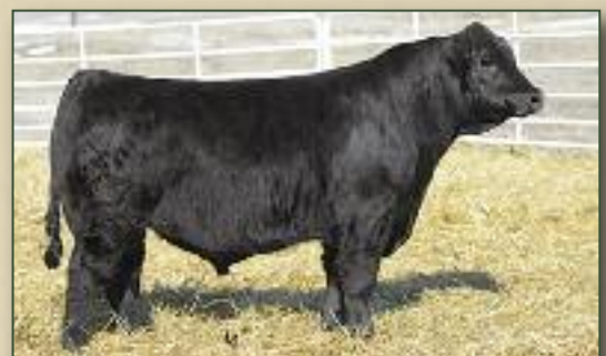
KBHR High Road