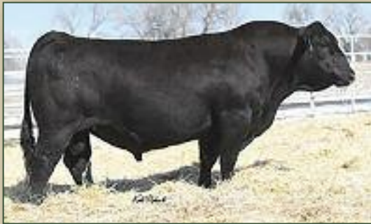
BCLR Cash Flow